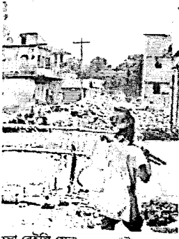
ফেলা বেইলি সেতু