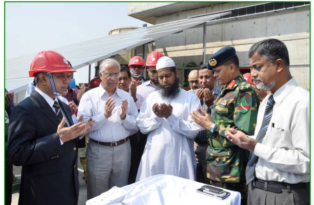
Inauguration of 49 kWp Solar Power Plant