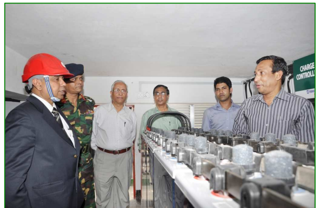
Demonstration on 49 kWp Solar Power Plant