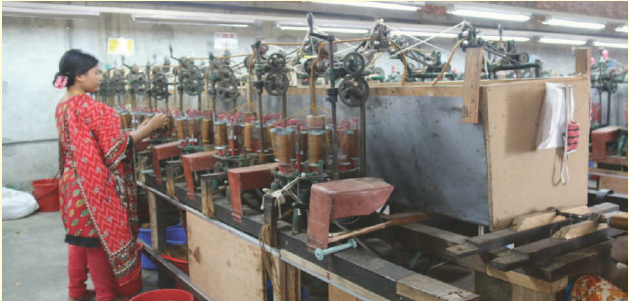
গ্রামীণ নারী কর্মসংস্থানে পল্লী বিদ্যুৎ

BREB has purchased 142.61 Crore kWh of electricity from different IPP/CPP/CIPPs, which cost 604.98 crore Tk. The cost of same amount of electricity as per Bulk Supply Tariff (BST) rate will be 717.70 Crore Tk. BREB has saved approximately 112.72 Crore Tk by purchasing electricity from IPP/CPP/CIPPs instead of BPDB in 2022-2023 Fiscal Year.